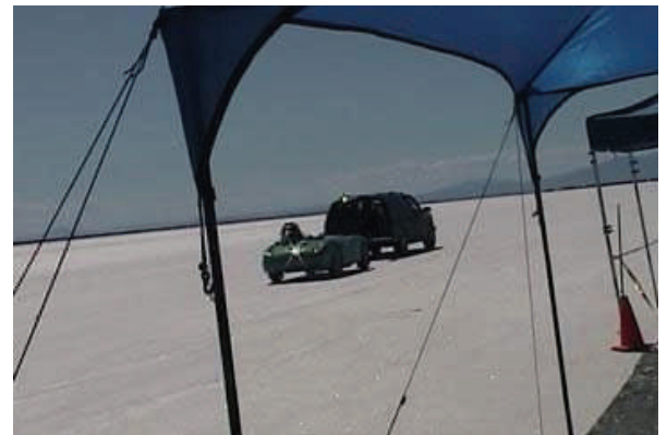
Endurance car heading back to the start line. As you can see we were under a canopy with nothing but salt around us.