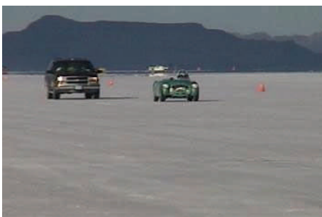
The return with chase car after a successful run.