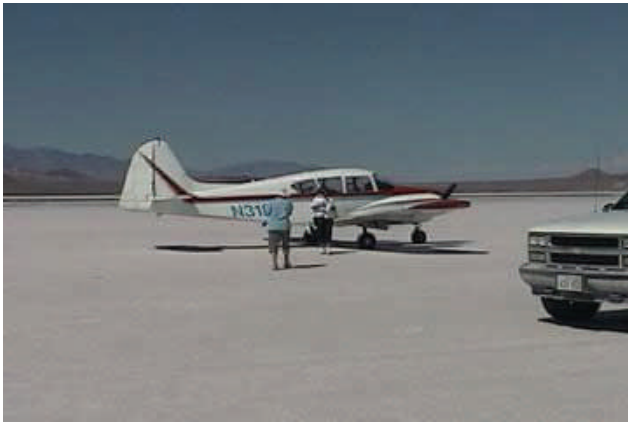
This plane landed on the salt flats near the Healey pits to bring parts for the Streamliner.