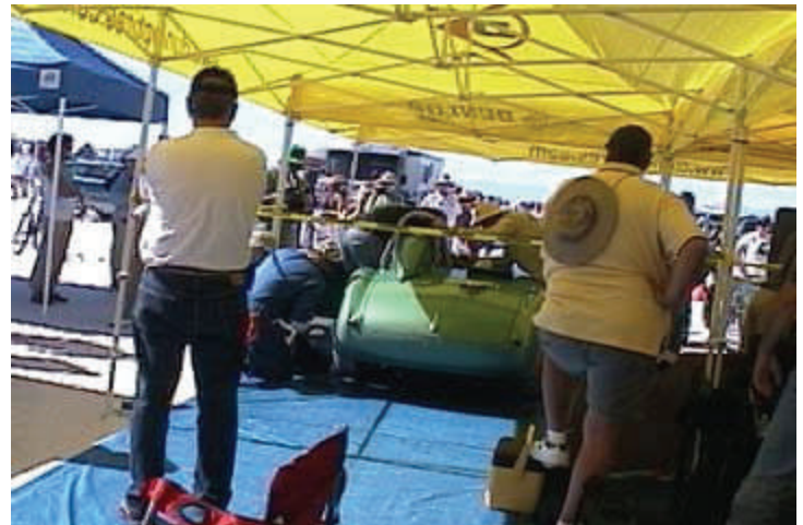
The center of activity on the salt for the Healeys was the under huge canopy donated by Dunlop Tires for the pit area. It was truly the