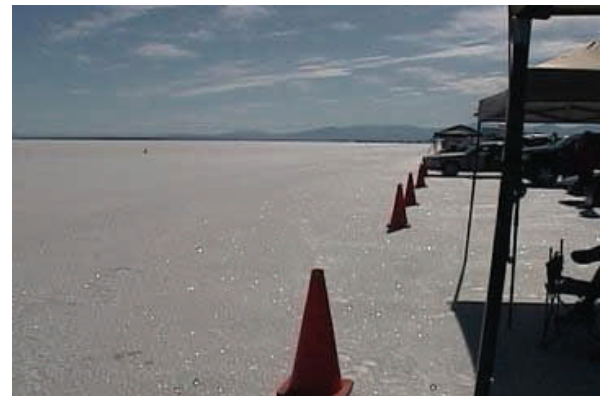
That thin line below the mountains is the start line. As I said, that was 2 1/2 miles from where we were viewing the runs.