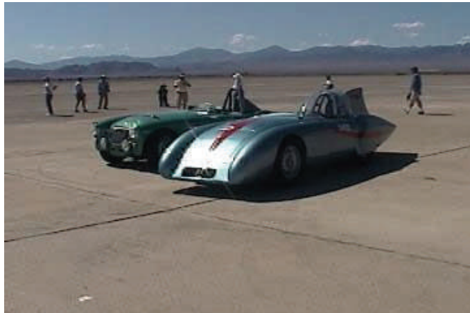
The endurance car and the streamliner at the airport