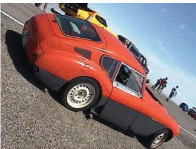
This future Nasty Boy was spotted on the road to the Flats. He had driven it from Minnesota. No one was allowed on the Salt, so a lot of cars were waiting to get word if & when it