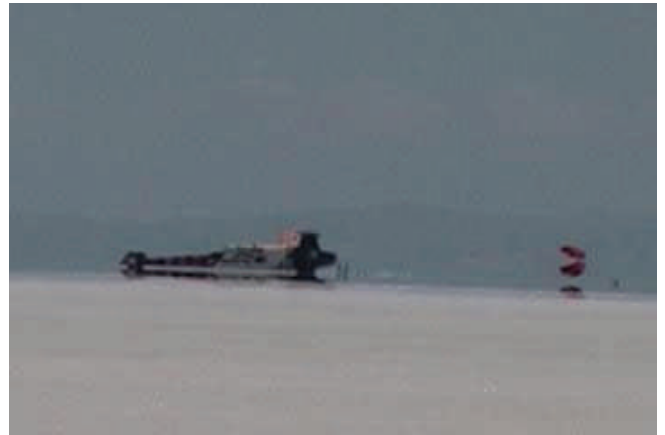
One of many stream liners that ran. This one had problems and the chute opened early. Several different cars blew engines just after starting and the track had to shut down to clean up all the parts.