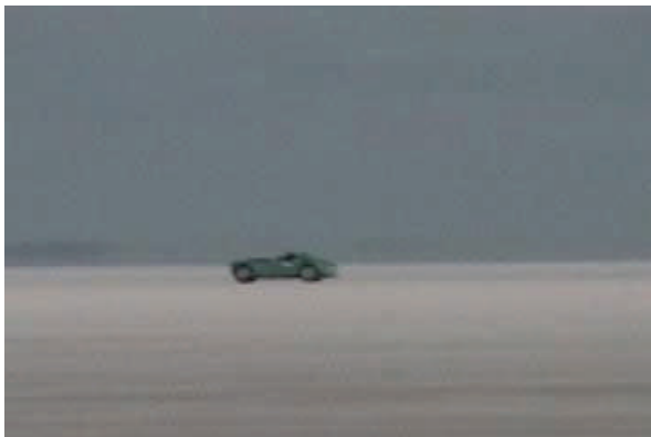
Not sure if this is Joe or Bruno driving in the speed run.. We were at about the 2 1/2 mile mark and the cars were like toy cars. The track was 7 miles long.