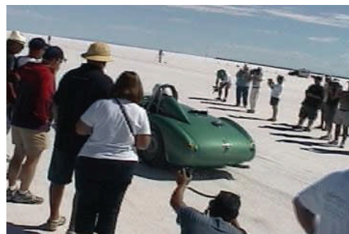
The endurance car taking off at the start line.