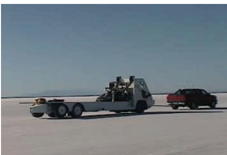
This was Ohio State University's entry. It is an electric hydrogen. It ran into problems at about the 2 mile mark and had to come off the track. It was very quiet. Couldn't hear it run at all